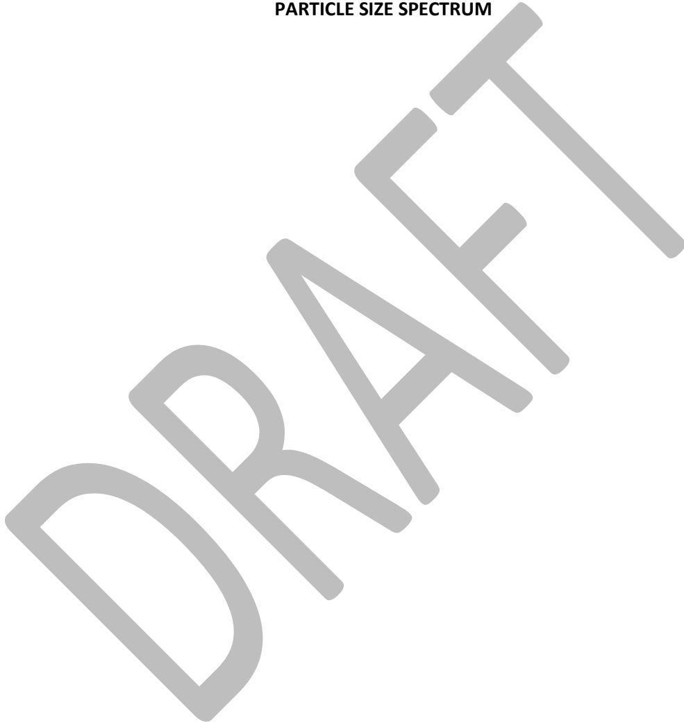
FIGURE A.1 PARTICLE SIZE SPECTRUM

Figure A.1 gives a comparison of particle sizes for different substances.