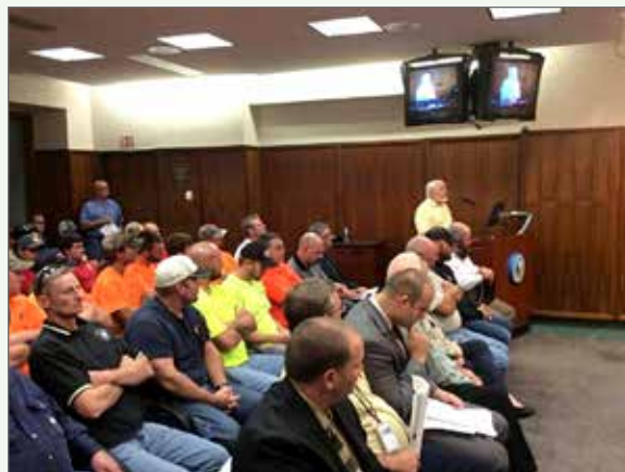
IPC Proponents testify at the Sedgwick County Board Meeting

For the first time in the County's history, Sedgwick has adopted the International Plumbing Code as an equivalent alternative for usage.