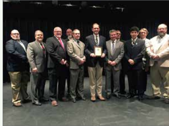
CAAK Members speak with Rep. Andy Barr (R-KY) and present him with Patron of the Year Award