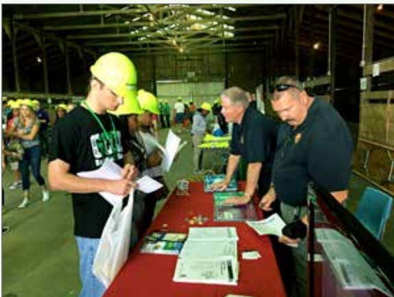
Members of the Ohio Building Officials Association welcome students to the ICC HSTTP in Cincinnati, OH

The ICC High School Technical Training program continues to partner with State and Local ICC Chapters and trade association to enroll new students and schools into the program and prepare the next generation of code enforcement.