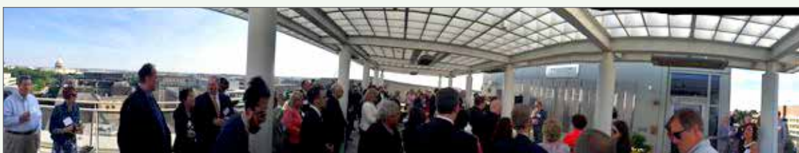
Rooftop reception at the ICC Headquarters in Washington, D.C. overlooking the U.S. Capitol (left)