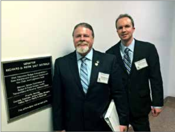
Chapter Members of the California Building Officials prepare to meet with State Senator Richard Roth

Government Relations staff across the country worked with ICC Chapter Members to meet with State and Local elected officials to advocate for Building Safety Month.