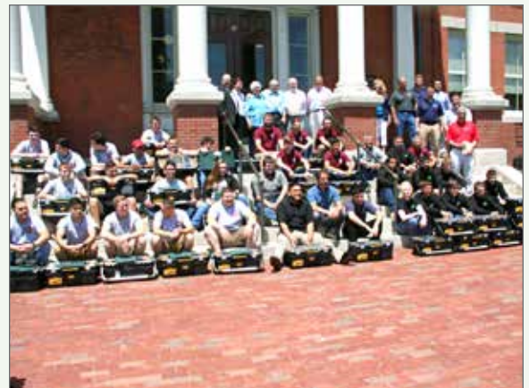
Rhode Island Building Officials host their 3 rd Annual HSTTP event providing students with educational materials, tools and gift certificates from participating sponsors