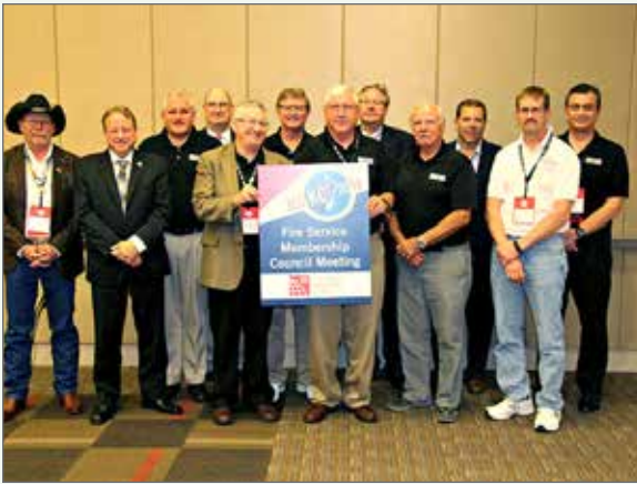
GR Vice President of Fire Services serves as staff liaison to the Fire Service Membership Council during their annual meeting in Kansas City, MO

Government Relations staff all ICC Membership Councils as they conduct business throughout the year holding in person meetings in Louisville, KY and during the ICC ABM in Kansas City, MO. Cooperation between the Building Official and Fire Service membership councils led to the ICC Board of Directors supporting the Federal Fire Sprinkler Incentive and the Nicholas and Zachary Burt Carbon Monoxide Poisoning Prevention acts.