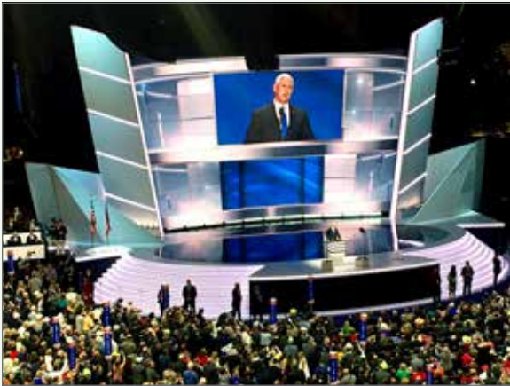
Vice President-Elect Mike Pence addresses the Republican National Convention in Cleveland, OH

Government Relations staff attended the Republican National Convention in Cleveland, OH and met with elected officials and staff from throughout the country including Speaker Paul Ryan (R-WI), Majority Leader Mitch McConnell (R-KY), Governor Nikki Haley (R-SC), Governor Scott Walker (R-WI), Governor Chris Christie (R-NJ), Governor John Kasich (R-OH) and surrogates for President Elect Donald J. Trump.