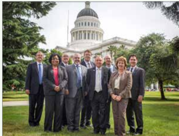
Participants of PMI Fly-In

ICC Government Relations staff participated with the Plumbing Manufacturers Institute on a “Fly-In” Summit to Sacramento, CA to advocate for PMG initiatives among industry stakeholders and policy makers.