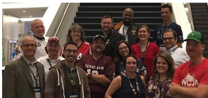
In Columbus, Ohio, for the April 2018 mid-year meeting.

We, the Members of the ELMC Governing Committee, appreciate the trust given to us by the ICC Board of Directors to serve the Code Council and accomplish the aims of Safety 2.0. We look forward to visiting with the Leadership of the Code Council at the 2018 Annual Conference in Richmond, Virginia.