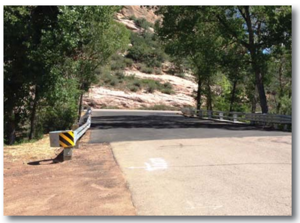
Cougar Road widening

"More than 1,500 building, mechanical, and roofing contractors have obtained a contractor's license in 2014."