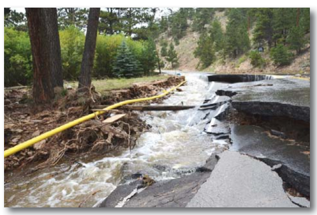
Damage in Coal Creek Canyon from the 2013 floods

Several heavy rains hit the Brook Forest area of Evergreen from July through October 2014. Road & Bridge made repeated repair efforts including replacing or flushing culverts, cleaning ditches, replacing asphalt and reseeding washed-out areas.