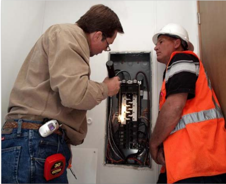
A county official inspects the wiring in a FEMA supplied mobile home in California.