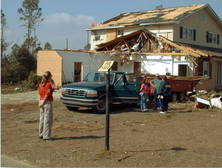
FEMA Community Relations team member speaks about available federal aid to victims affected by a deadly tornado that hit in 2011. An insurance agent waits her turn.