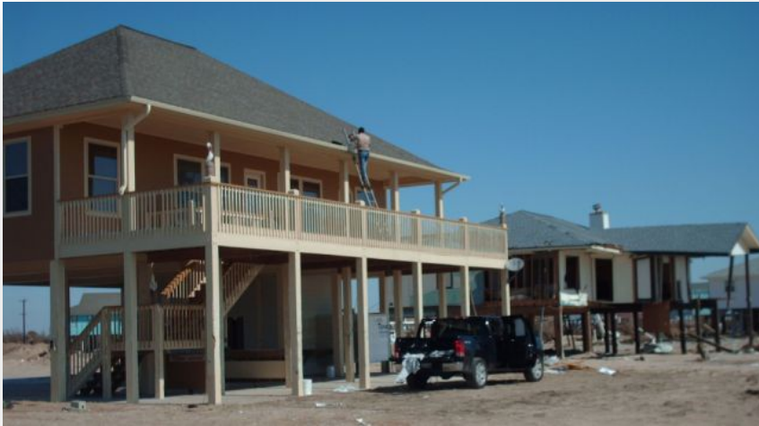
Jimmy and Debbie Bishop's house survived Hurricane Ike nearly unscathed.